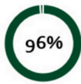
Working In BPI Related Field