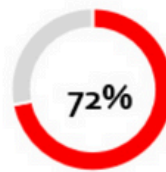
BPI "Extremely Valuable" To Their Business